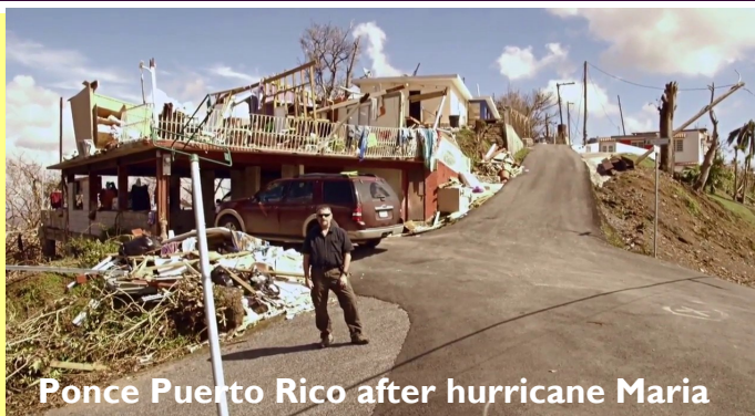
Ponce Puerto Rico after hurricane Maria

We also recently began making preparations for our 2019 Mission Trip. This year in June we will be heading to Puerto Rico to serve in the city of Ponce. Since being devastated by hurricane Maria a little over one year ago, Puerto Rico is a place that has been on my mind and on my heart. The last time we were in this beautiful country was about six years ago. Among all of the trips we have taken with our ministry, it is one trip that has always stood out for me. The location is beautiful of course, but we had a loving church hosting us with local families preparing meals for a bunch of teens they didn't know. While we were rehabbing a dilapidated home gifted to the church we constantly had strangers from the community stop